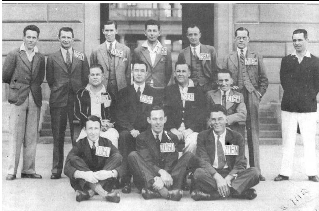
PRETORIA SECTION S.A.R.L. 1929

Bulletin repeats | herhalings : Mondays 19:45 on 145,725 MHz